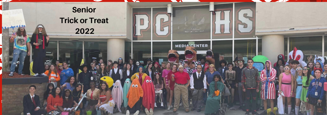
Senior Trick or Treat 2022